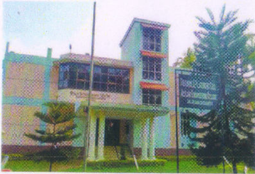
MULTI DISCIPLINARY CENTER