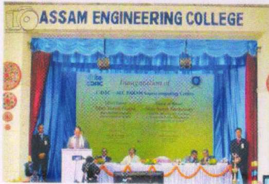
AEC MAIN AUDITORIUM : DURING SUPERCOMPUTING CENTER INAUGURATION