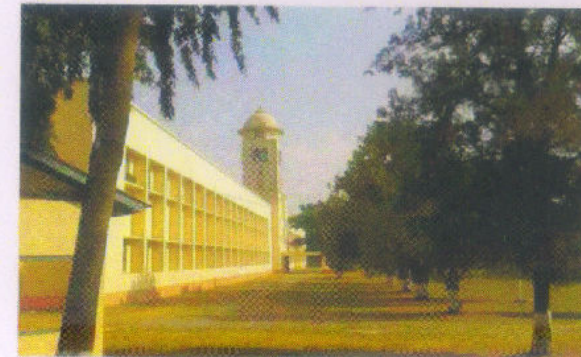
MAIN ACADEMIC BUILDING