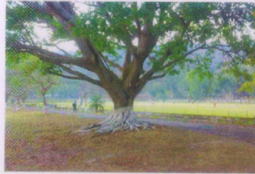
AEC PLAY GROUND