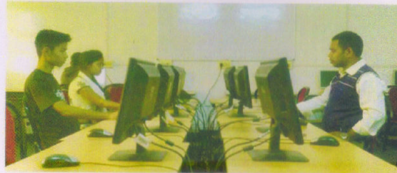
AEC CENTRAL COMPUTING CENTER