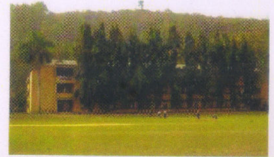
AEC HOSTEL 6