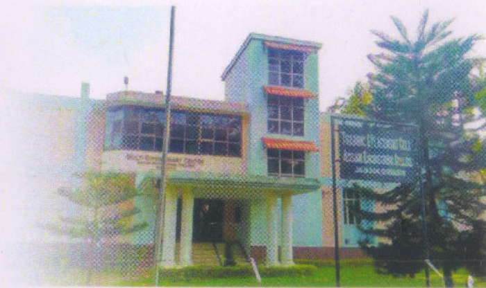
TRAINING AND PLACEMENT CELL